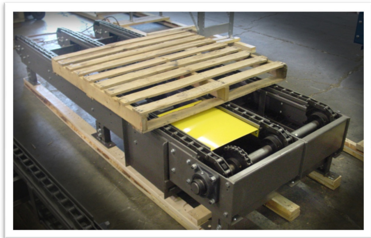
SHOWN WITH OPTIONAL FORMED FRAME AND CHAIN END DRIVE

PLEASE CONTACT THE FACTORY FOR APPLICATION ASSISTANCE.